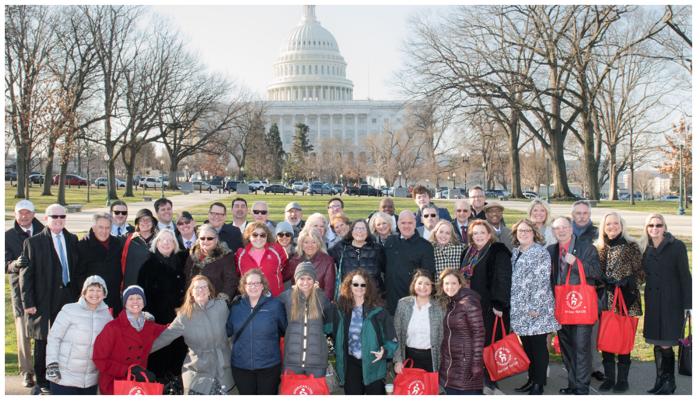
ALF advocates make their voices heard in Washington, DC.