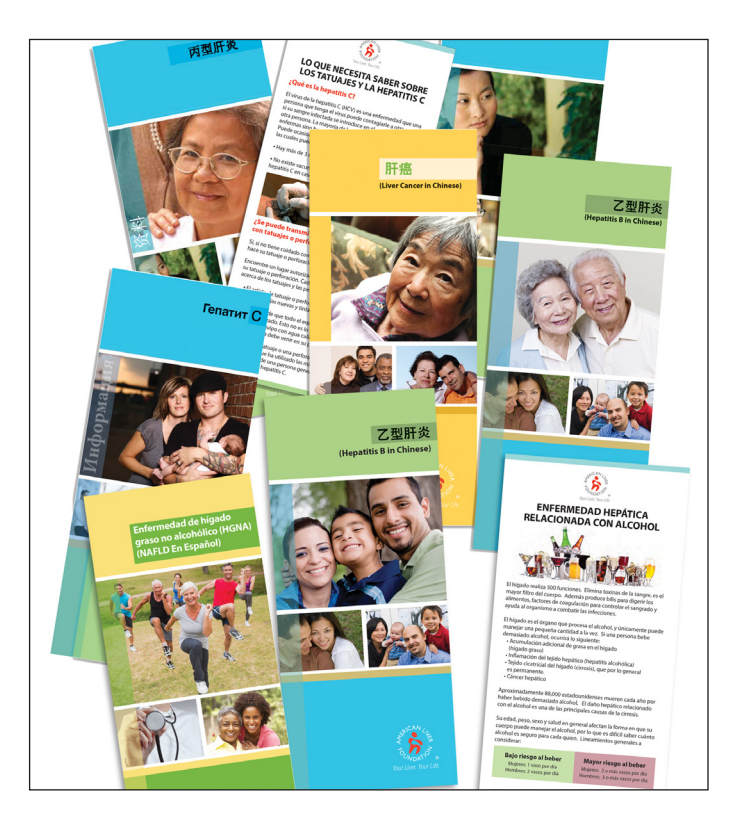
ALF's resource library has materials available in multiple languages that cover more than 30 subjects.

our toll-free National Helpline, national webinar series, materials, and interactive website.