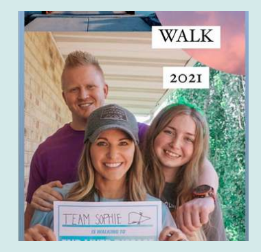
On June 5, 2021 ALF broadcast a live virtual walk across the country. The event included participation from Team Captains, sponsors and top fundraisers. Despite being a virtual walk, we were joined nationally by 274 teams who raised over $360,000.