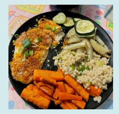
<u>Cuisine for a Cause</u>, took place virtually on April 24, 2021. We welcomed 430 guests and raised nearly $200,000. Guests were mailed pre-packaged HelloFresh boxes allowing participants to cook alongside one of two professional chefs, live!