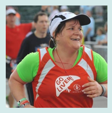
ALF's endurance program, <u>Liver Life Challenge</u>, offered three new events this year: 45 in 45, 20-day cycling challenge and El Tour de Tucson. Collectively, the program engaged over 150 individuals and raised over $700,000.